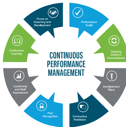
Continuous Performance Management facilitates ongoing dialogue between managers and employees